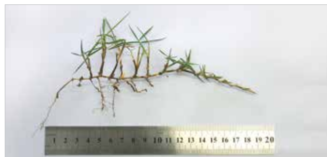
Close-up of live stolon.