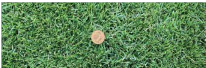
$2 coin on wide shot of grassed area.