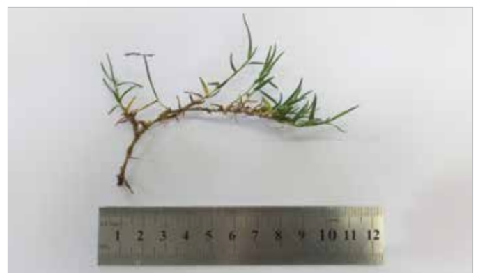
Close-up of live stolon.